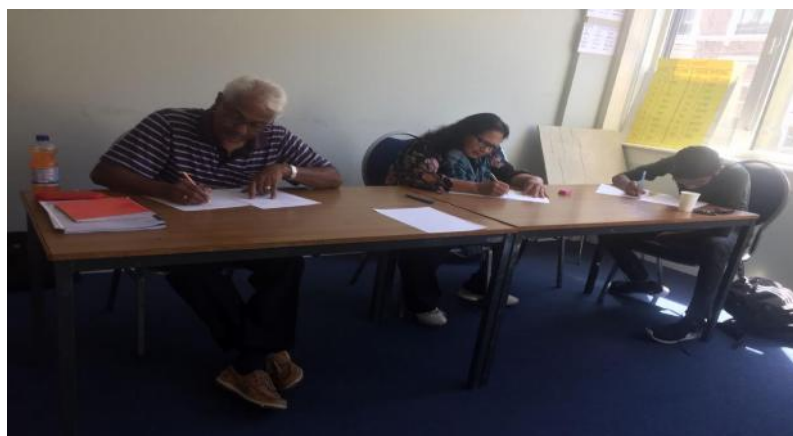
Hindi Students writing Level 3 exam at The Gandhi Centre