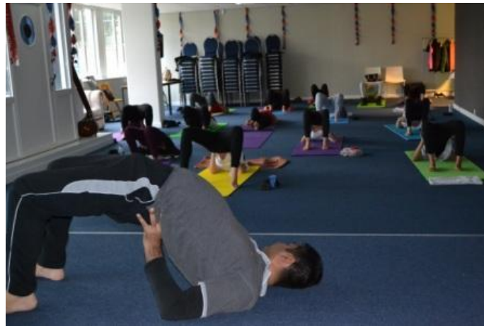
Yoga Class at The Gandhi Centre